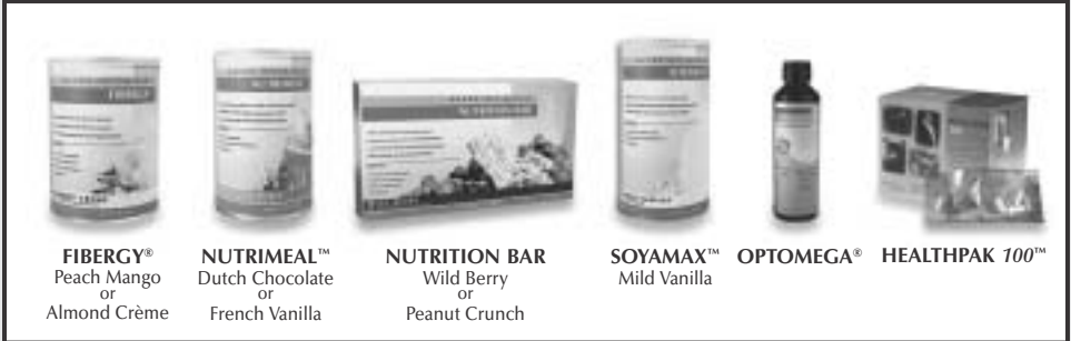
FIBERGY® Peach Mango or Almond Crème

Choose one of each of the following products to begin.